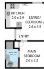
STUDIO (NOT IN POSITION)

95 Tonkin Road, Labertouche, VIC, 3816 TOTAL APPROX. FLOOR AREA 373 SQ.M