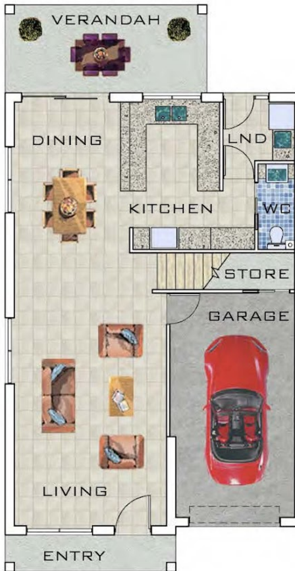
GROUND FLOOR SCALE 1:100