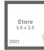
LEVEL 26 2.7m Ceiling