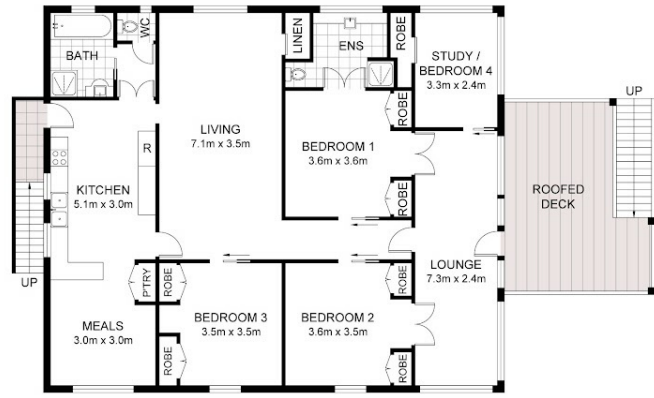
DWELLING 1 UPPER LEVEL