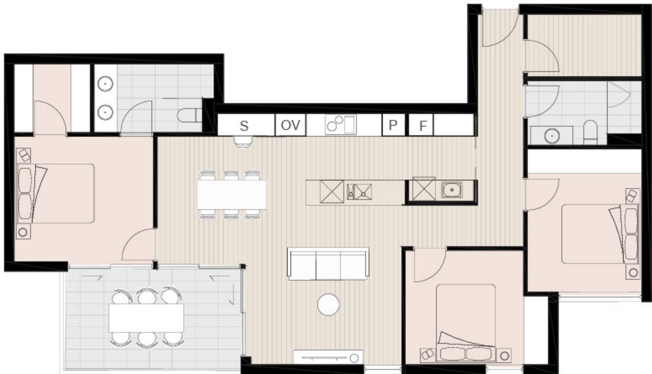
CALACATTA GOLD SCHEME

Disclaimer: Please note this floor plan is for marketing purposes and is to be used as a guide only. All dimensions are estimates only and may not be exact measurements.