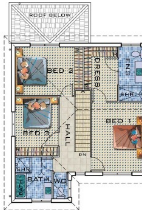
FIRST FLOOR SCALE 1:100