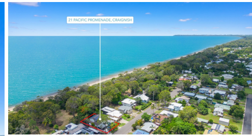
21 PACIFIC PROMENADE, CRAIGNISH