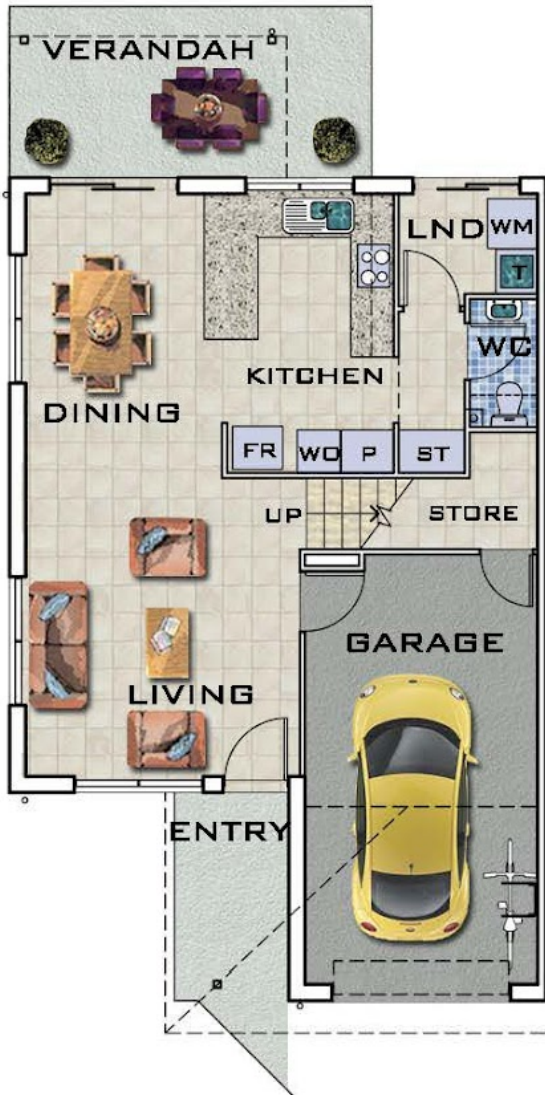
GROUND FLOOR SCALE 1:100