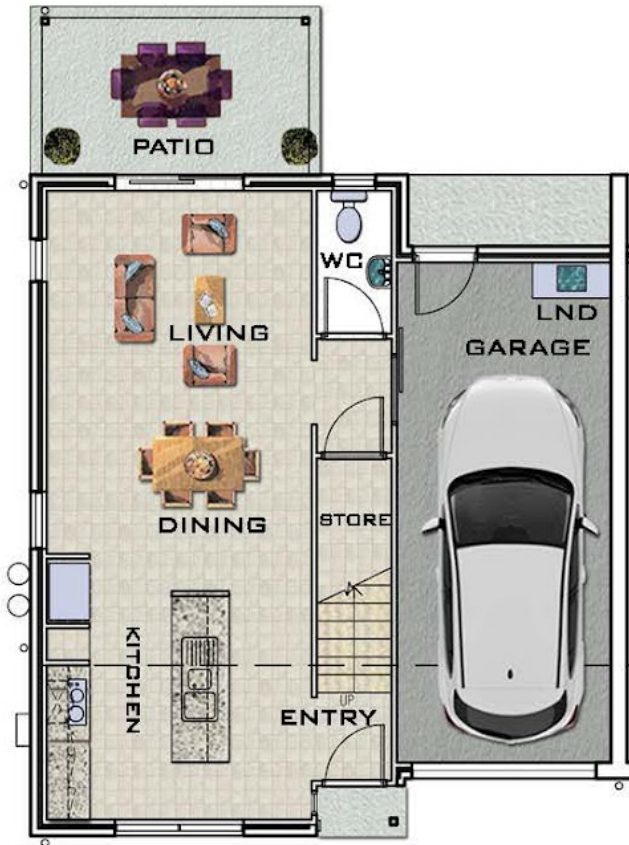
GROUND FLOOR SCALE 1:100