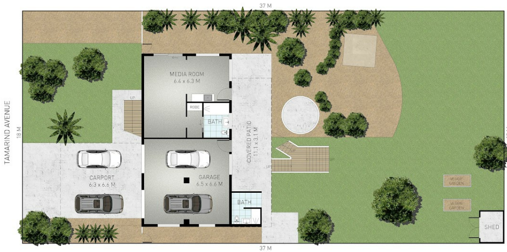
GROUND FLOOR & SITE PLAN