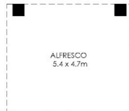
ALFRESCO 5.4 x 4.7m