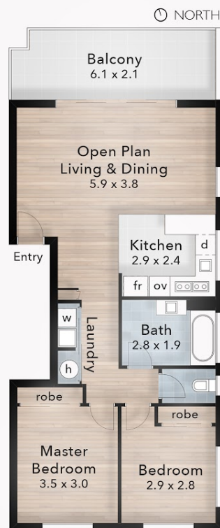
// FLOOR PLAN Third Level