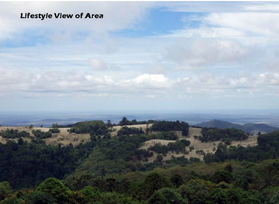
Lifestyle View of Area